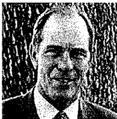
Opening Session Speaker – Wednesday, November 19th Steve Ford Actor, Speaker and Son of Former US President Gerald Ford